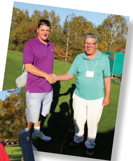
Hole in One