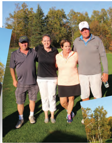
2016 Second Place